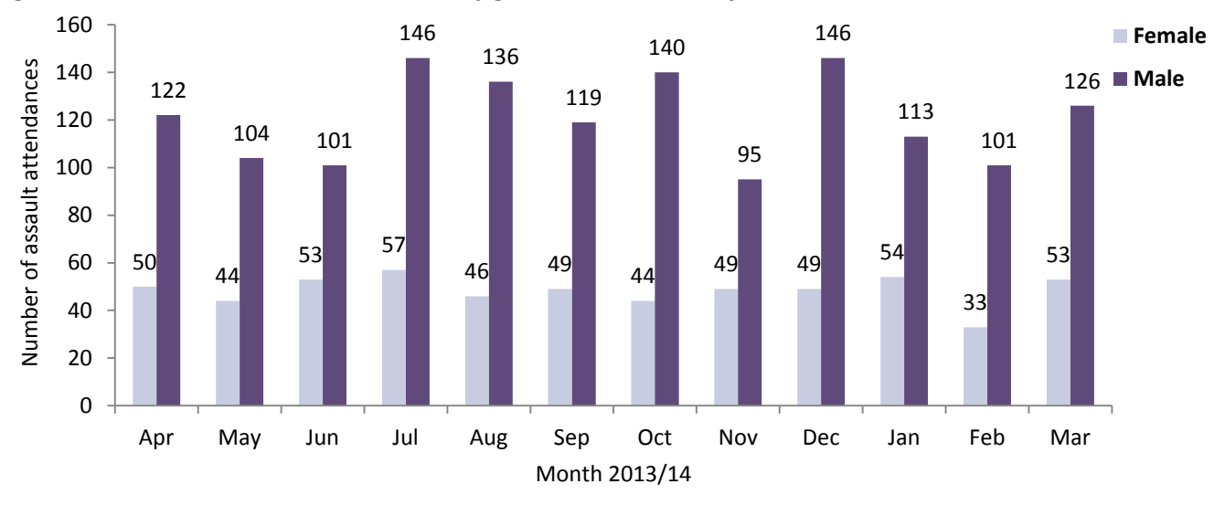
Figure 3: ED and UCC assault attendances by gender and month, April 2013 to March 2014